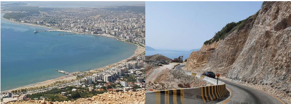
View down on Flora from the brand new bypass road, partly still single-lane, # 01.08.2021

There are pedestrian traffic lights that are equipped with LED light strips from top to bottom, free urban WiFi in Tirana and an amazing construction boom, at least in the cities of Vlora and Tirana, which have again been visited. About 14 days ago, a 28.7 km long bypass road from Levan (Fier) to Vlora over and through the mountain ridges was opened to traffic, still two short and "difficult" sections of the route are single-lane.