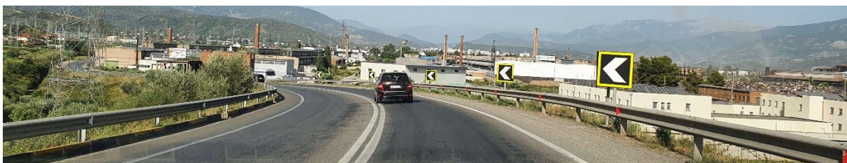
Kurum steelworks in Elbasan # 01.08.2021, the view reminds to Hüttental (steelmill-valley) at Siegen many years back.